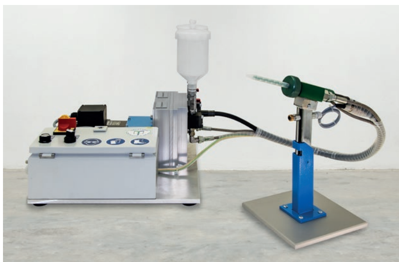
Compact solution for low quantity dosing: With the newly launched MDMD4 mixing and dosing system, Tartler presents at FAKUMA a versatile table device that can efficiently and precisely mix and dose synthetic resins.

facturer has subjected this table device to a thorough re-engineering and newly positioned in its series of compact systems for the efficient and precise processing of small quantities of liquid and low-viscosity two-component synthetic resins. With the new MDM 4, TARTLER offers users who work with processing quantities on the cartridge scale an innovative entry-level innovative and cost-efficient solution in mechanical and largely automated synthetic resin processing. Typical areas of application for the table device are, for example, the production of pilot series and prototypes as well as applications in electro grouting, glue application or RIM (resin injection moulding). The compact systems in the MDM series can be found in many development and test laboratories.